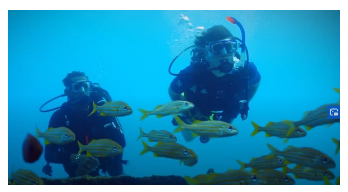
The Caribbean . . . Episode 2