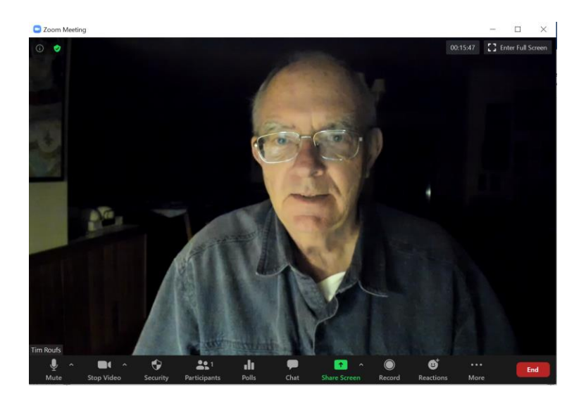
Live Chat is optional.

Tuesday, 7:00-8:00 p.m. (CDT) "ZOOM" [click here] e-mail anytime: mailto:troufs@d.umn.edu [click here]